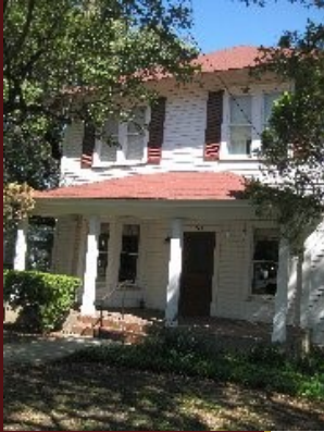
The Center for Children and Families is located at Swinney House on the Texas State University campus.