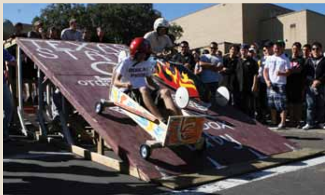
The annual soapbox derby is a homecoming favorite and the oldest student tradition at Texas State. A big crowd gathered along Bobcat Trail to cheer the drivers.

Discover Texas State also took place the weekend of homecoming. This event is the university's premier open house. The Alumni Association hosted van tours of the campus to show alumni how the university is changing. Alumni and friends had a day full with tours, lectures, hands-on demonstrations, exhibits and other activities.