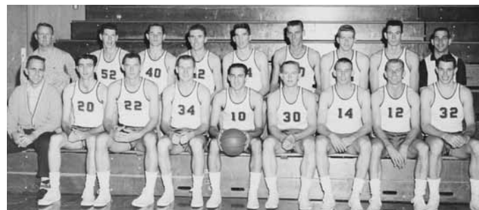
The 1960 championship team