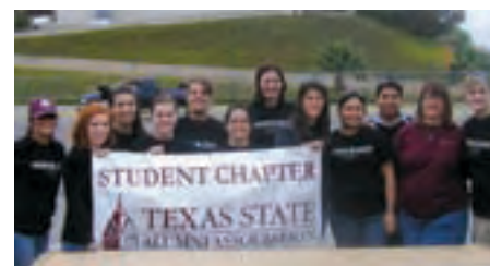
Members of the Student Alumni Chapter joined 2,500 other students for a day of community service at Bobcat Build in April.