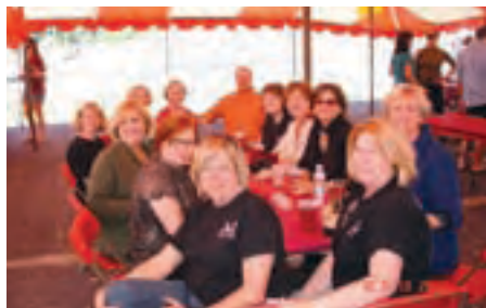
The Texas State Alumni Association hosts a fajita tailgate before every homecoming game. The Delta Zetas enjoyed themselves at last year's homecoming.

The recipients will be formally presented their awards at a dinner Friday, Oct. 30. Make plans to attend the ceremony.