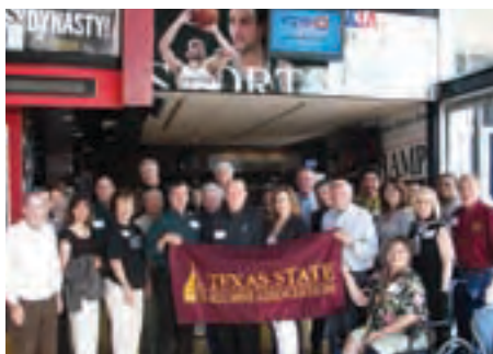
Alumni had a pre-game reception in April at a San Antonio Spurs game where the Strutters performed.

River. As this tradition has grown, so has the number of recipients. More than 250 rings were presented, and many others attended to dip their rings as well. The official ring of Texas State is decorated with engravings of the Texas star, Old Main and tubers on the San Marcos River. The ring represents a connection with classmates as well as alumni and serves as a symbol of a student’s achievements.