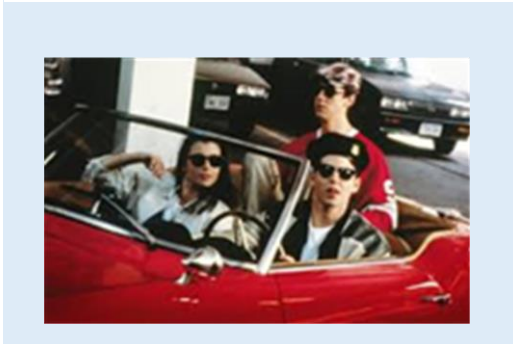
Ferris Bueller: Truant?

A party may file a motion to dismiss the petition because the child has a mental illness. Family Code § 65.065(a).