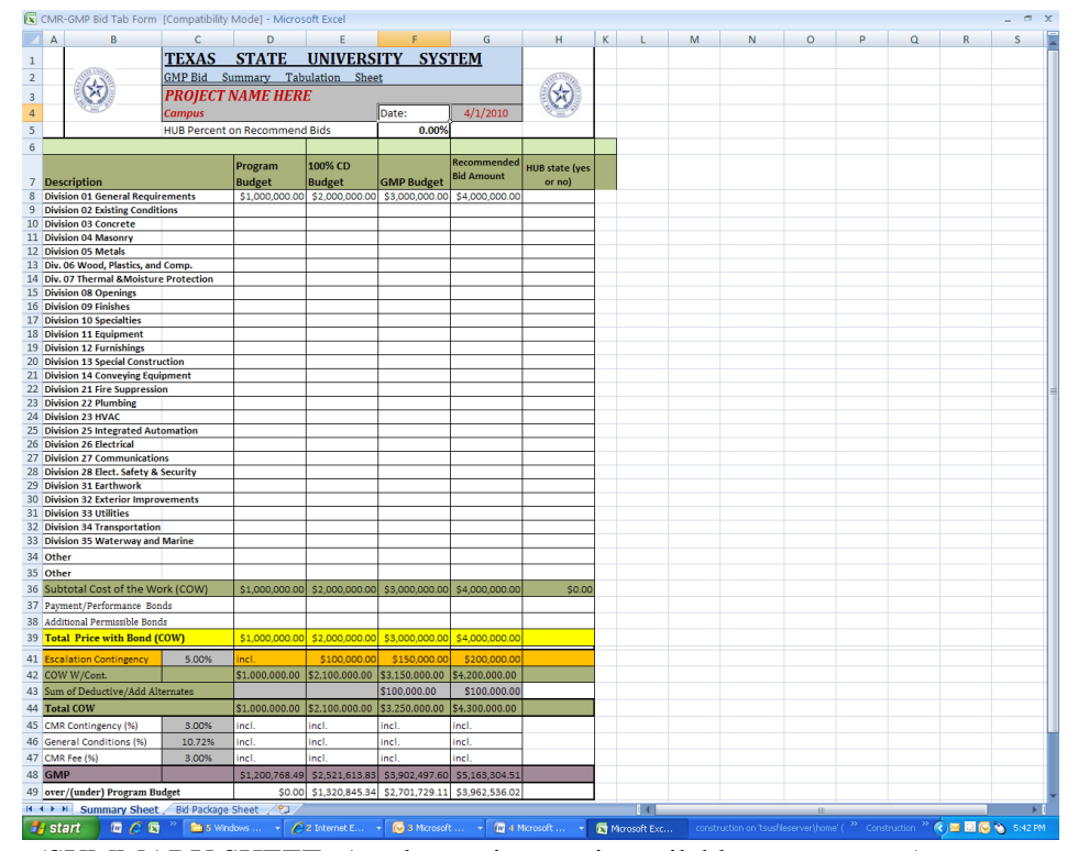
(SUMMARY SHEET- An electronic copy is available upon request)