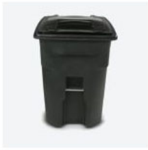
Trash & Recycling